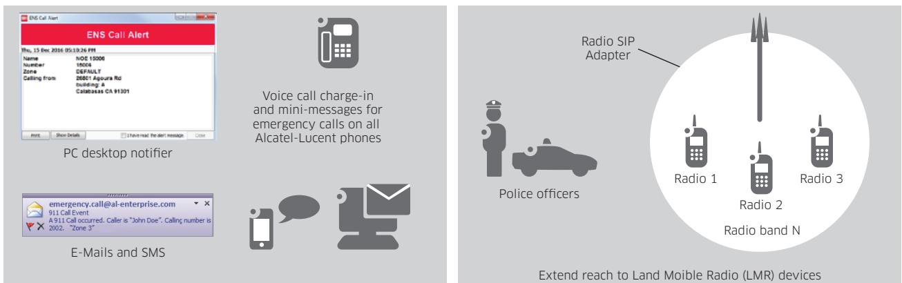
Figure 1. ENS notification types