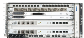
7360 ISAM FX-4 — Multi-service shown