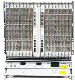
7360 ISAM FX-16 — GPON shown