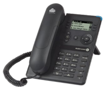
8008 CE 8008G CE