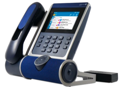
10BT-SPE Adapter connected to ALE DeskPhone IP/SIP