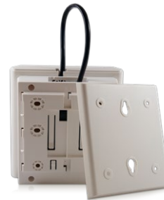
Spacer box for 10BT-SPE Adapter