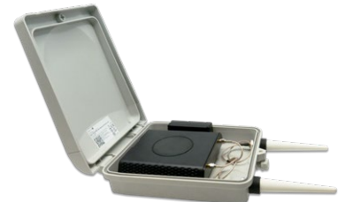
ALE IP-XBS DECT base station outdoor with 10BT-SPE Adapter